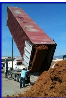
unloading tip-up container

The above information was obtained through our knowledge, agronomic elements firmly established today, constant quality controls and collaboration with our customers, however, we reserve the right to introduce changes if variations are found. La Mundial de Coco SRL cannot be held responsible for any adverse consequences derived from any improper use of this product.