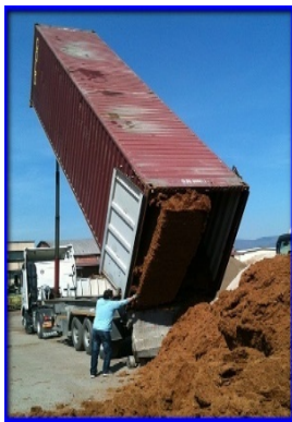
unloading tip-up container

The above information was obtained through our knowledge, agronomic elements firmly established today, constant quality controls and collaboration with our customers, however, we reserve the right to introduce changes if variations are found. La Mundial de Coco SRL cannot be held responsible for any adverse consequences derived from any improper use of this product.